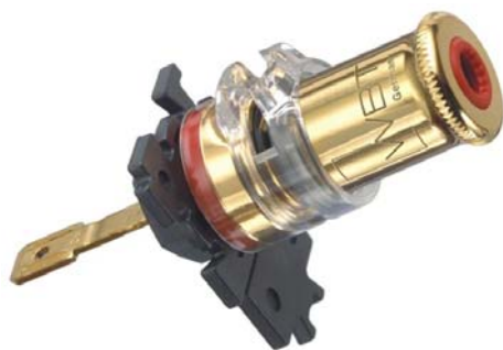
WBT-0710 Cu RoHS compliant